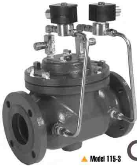
▲ Model 115-3