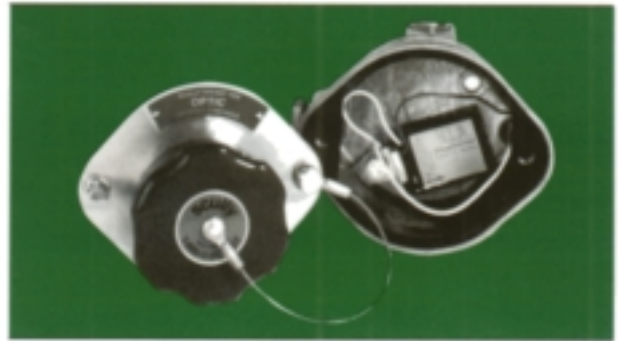
T.I.M. Installed In Scully Overfill Prevention Socket

The Scully Truck Identification Module™ (T.I.M.™) provides a unique serial number to the Vehicle Identification Prover® (V.I.P.®) System control unit which allows the truck to communicate with the terminal during loading. The system is used in conjunction with your Scully tank truck overfill prevention and vehicle static grounding controls. The T.I.M. allows you to: