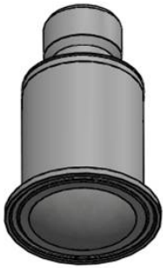
Tri clamp 2"