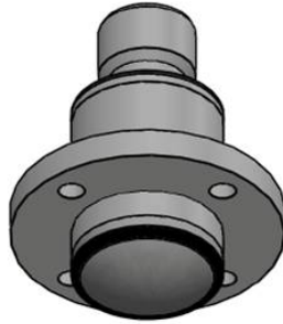
Neumo Biocontrol DN 50