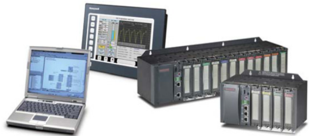
Figure 2: HC900 Controller, 900 Control Station OI and Hybrid Control Designer Software

Overview. The HC900 as shown in Figure 2 consists of a panel-mounted controller, available in 3 rack sizes along with remote I/O racks, connected to a dedicated Operator Interface (OI).