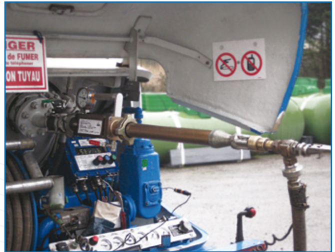
LPG ETALCOMPT in situation