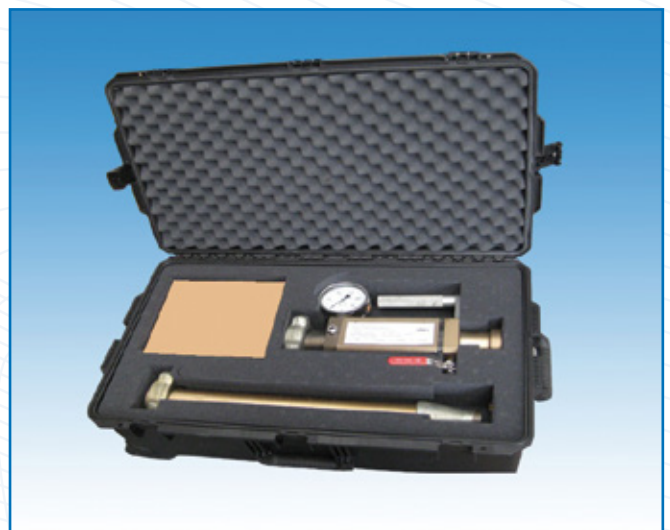
LPG ETALCOMPT protective transport suitcase